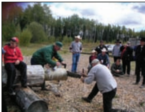
Logger's Sports at the Fall Fair

BL ComFor also provided $235,000 for the Village of Burns Lake's new First Nations interpretive centre along Highway 16, and has designated more than $100,000 to cover the facility's future operating costs.