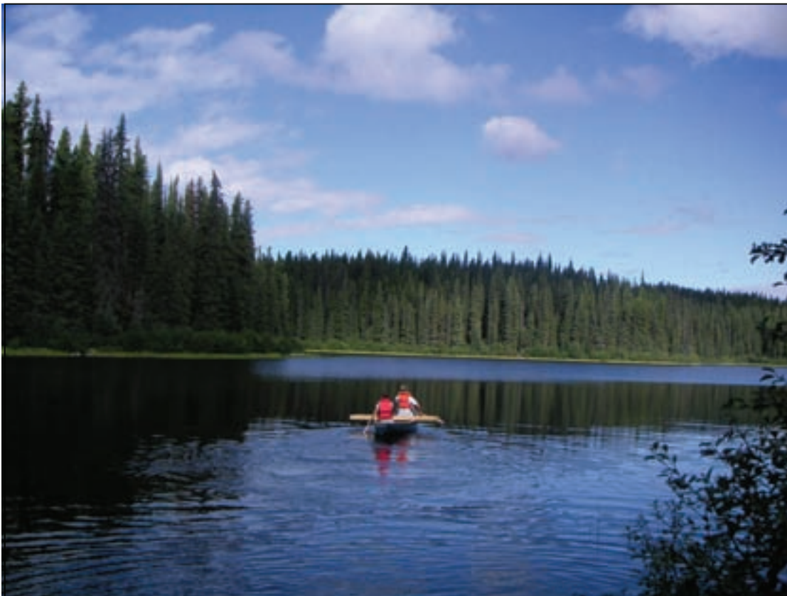
Star Lake Construction Crew at work