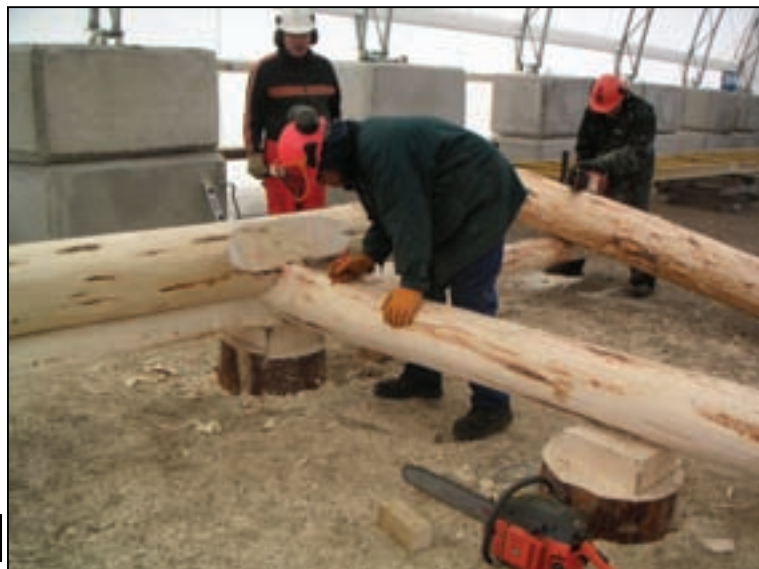
Log Building course at CNC

BL ComFor has also been heavily involved in the financing and construction of Burns Lake's new First Nation's interpretive centre. This centre, located at the junction of Highway 16 and Sixth Avenue, will feature information relating to the history and culture of local First Nations.