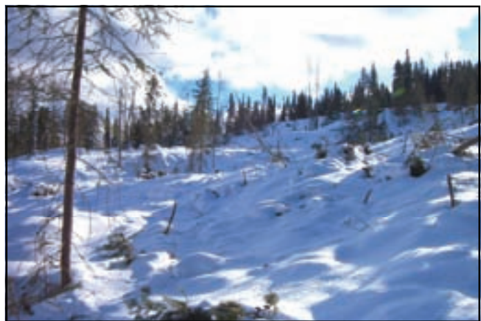
RIGHT: A view of harvest block #4 in the Gerow Creek area south of Decker Lake.