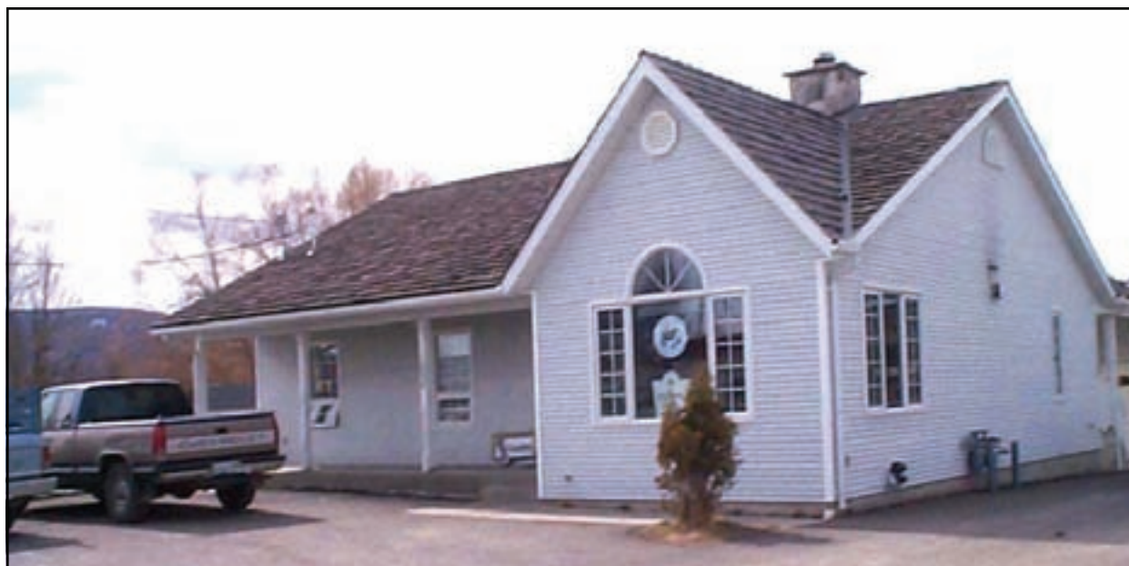
The ComFor Building, 153 Francois Lake Drive – The home of Burns Lake Community Forest Ltd.