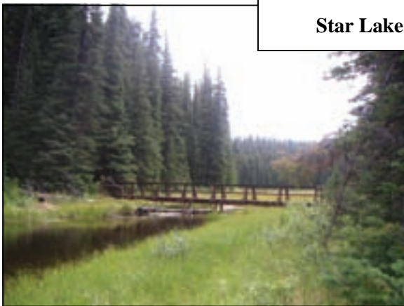
Star Lake Trail Scenes

The company's board continues to encourage participation from the local community, and would like to see more residents express interest in serving on the board of directors.